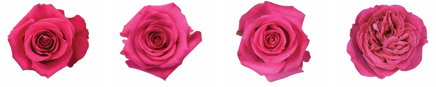
High & Mora