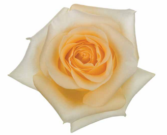
Crème de la Crème