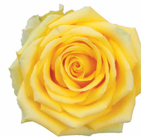
High & Exotic