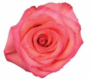
High & Orange