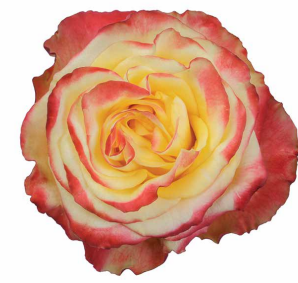
High & Yellow Flame