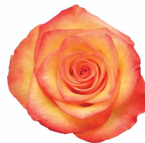
High & Magic