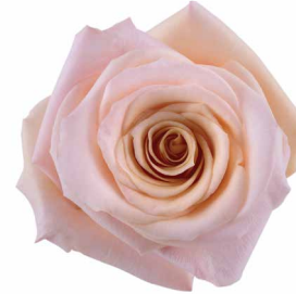
Mother of Pearl