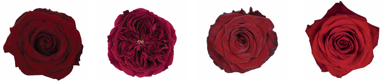
RP Black Pearl